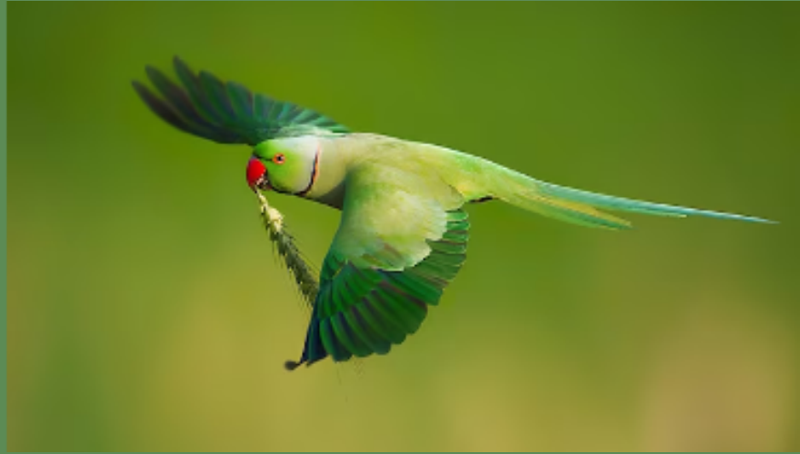
Rose-ringed parakeet – Psittacula krameri